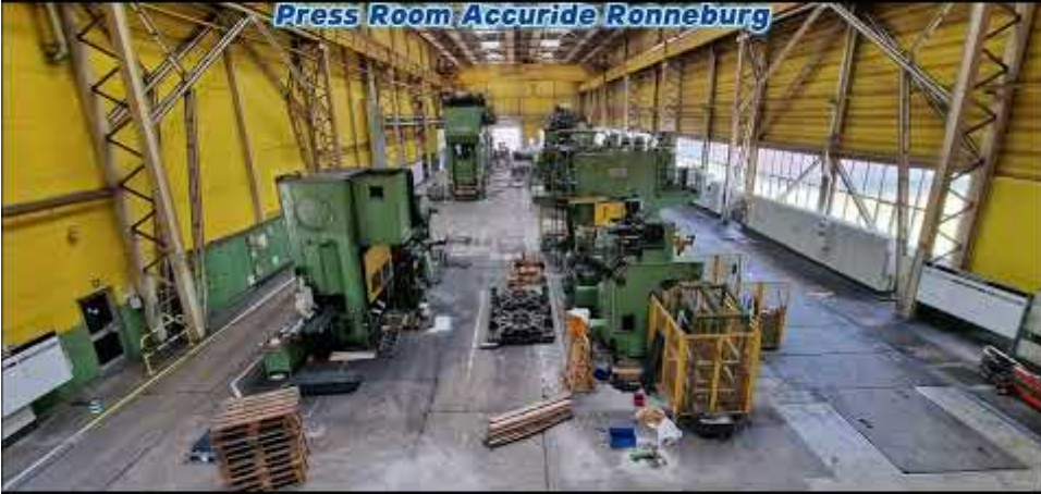
Press Room Accuride Ronneburg