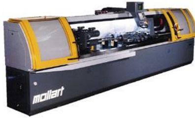
1500mm Drilling Depth Version