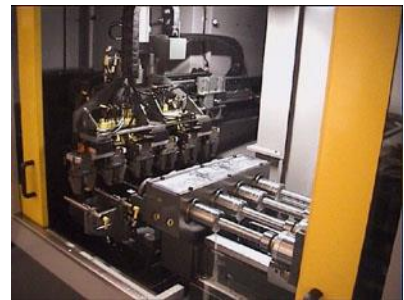
Turnkey Solutions with gantry system as part of the machine.