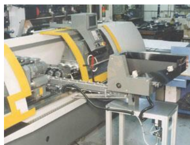
Autoloading of a Windscreen Wiper Shaft. A \text{Ø}3\text{mm} \times 150\text{mm} hole was Gundrilled to allow Washer Fluid to be pumped through into to washer jets mounted on the Windscreen Wiper Blade Arm. The Feeder unit has the capacity to operate for one full shift.