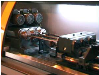
Work rotation Units for maximum concentricity between bore & outer diameter. Parts can also be fixtured on the machine table