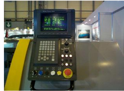
Fanuc CNC Control System with programmable spindle feed rate, drilling depth & Process Monitoring