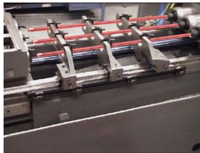
CAM-operated Auto-whipguide positioning