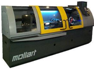
750mm Drilling Depth Version