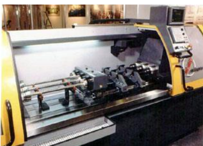
The Drillsprint specialises in gundrilling shafts using counter-rotation units to produce concentric bores where the wall thickness of component is critical, or alternatively tooled with table mounted fixturing for prismatic parts.