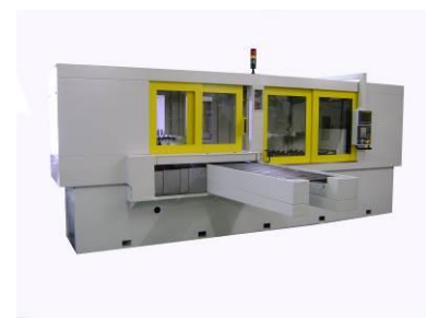
Sporting rifle barrels are fed through the machine with an automatic conveyor that indexes the parts through after drilling. The range of parts were drilling diameters from \text{Ø}5 - \text{Ø}10\text{mm} and lengths from 300mm - 750mm and bar max \text{Ø}40\text{mm}