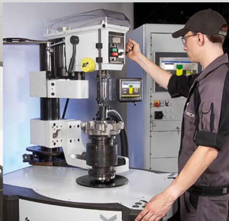
Even small, light rotors can be balanced with high precision.